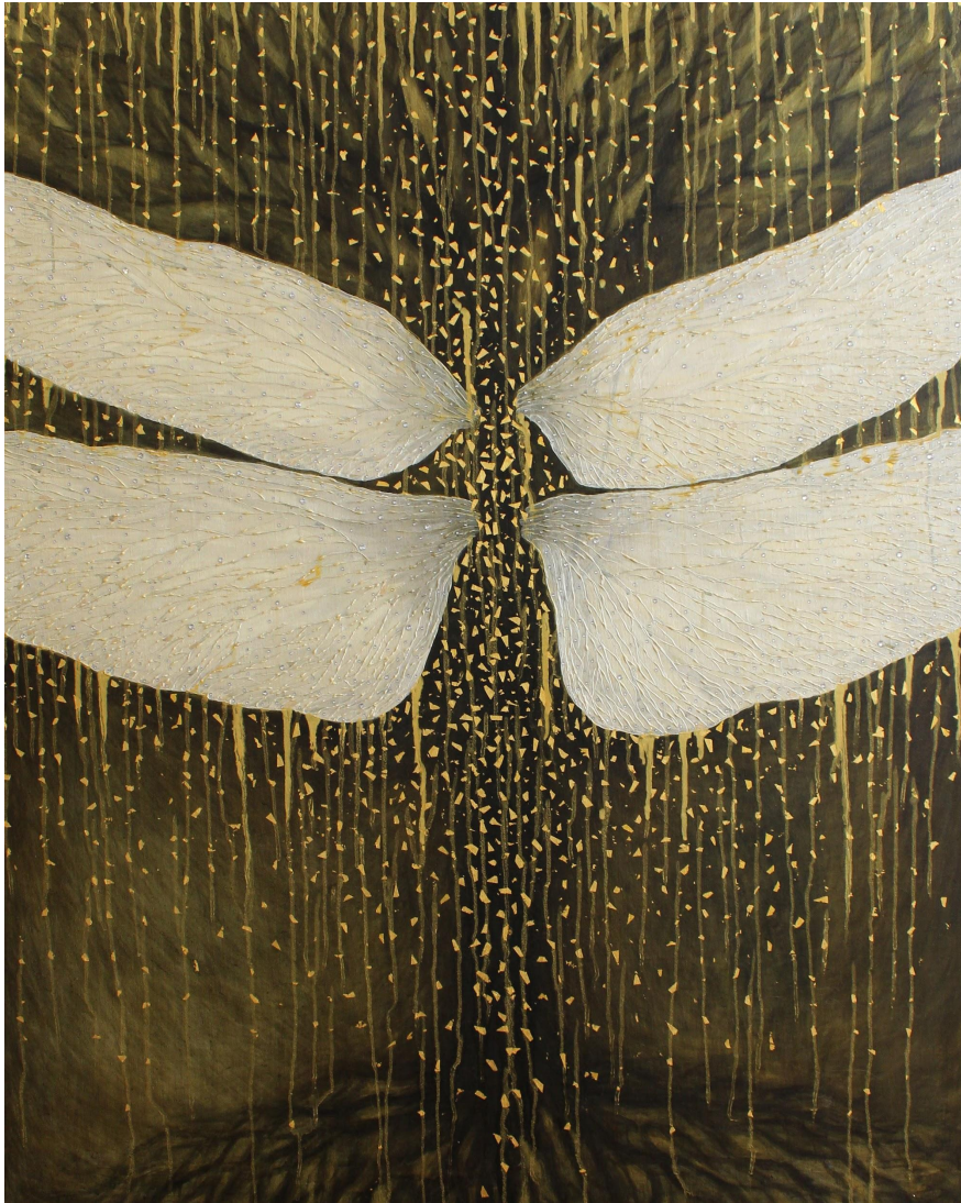
Eun Kim Continuity Oil on canvas with Swarovski crystals and 24k gold 31.6 x 39.4 inch $ 3,000