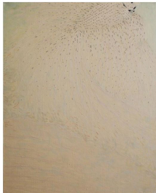
Eun Kim Harmony Oil on canvas with Swarovski crystals 71.7 x 28.5 inch $ 9,000