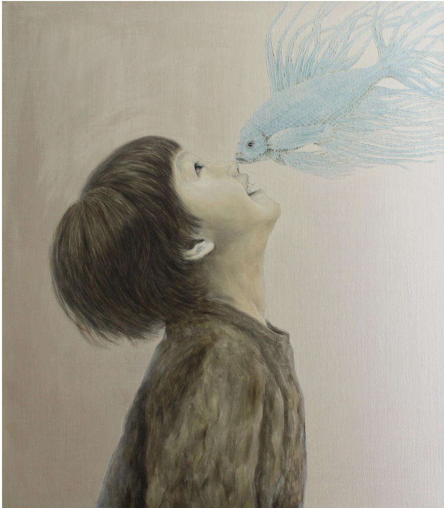
Eun Kim I can smile Oil on canvas 23.9 x 28.5 inch SOLD