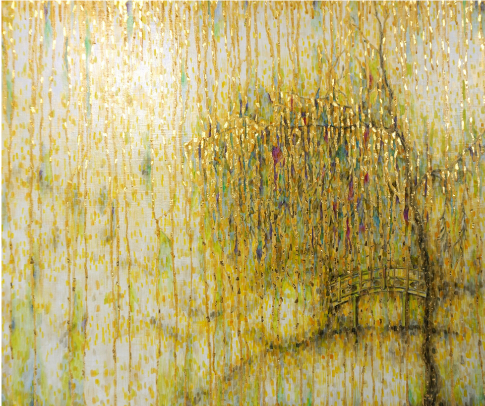
Eun Kim Brilliant Dawn Oil on canvas with 24k gold 28.5 x 23.9 inch $ 3,500