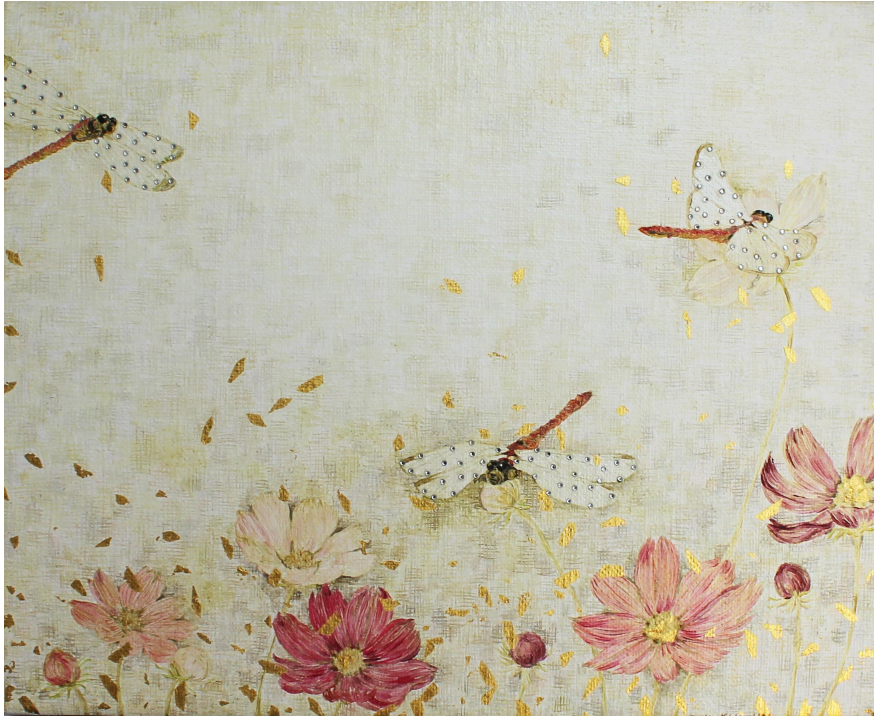
Eun Kim Brilliance #1 Oil on canvas with Swarovski crystals and 24k gold 13.6 x 10.5 inch $ 1,200