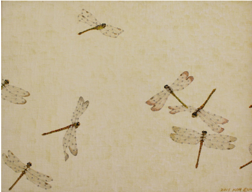
Eun Kim Brilliance #2 Oil on canvas with Swarovski crystals 13.6 x 10.5 inch $ 1,500