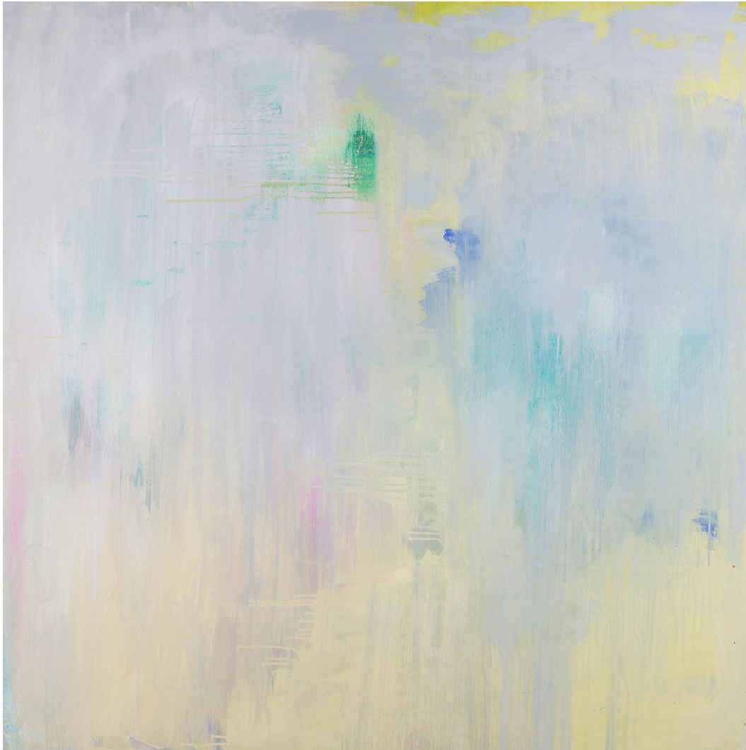
Grace Chun Summer Rain Oil on Canvas 48 x 48 inch $ 6,000