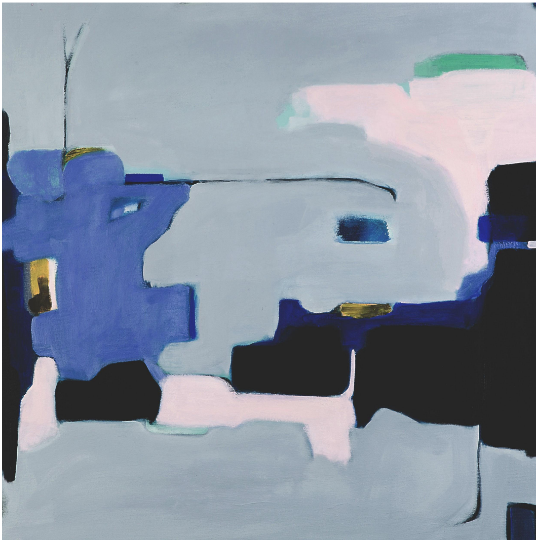
Grace Chun Mood Sensors Oil on Canvas 30 x 30 inch $ 3,600