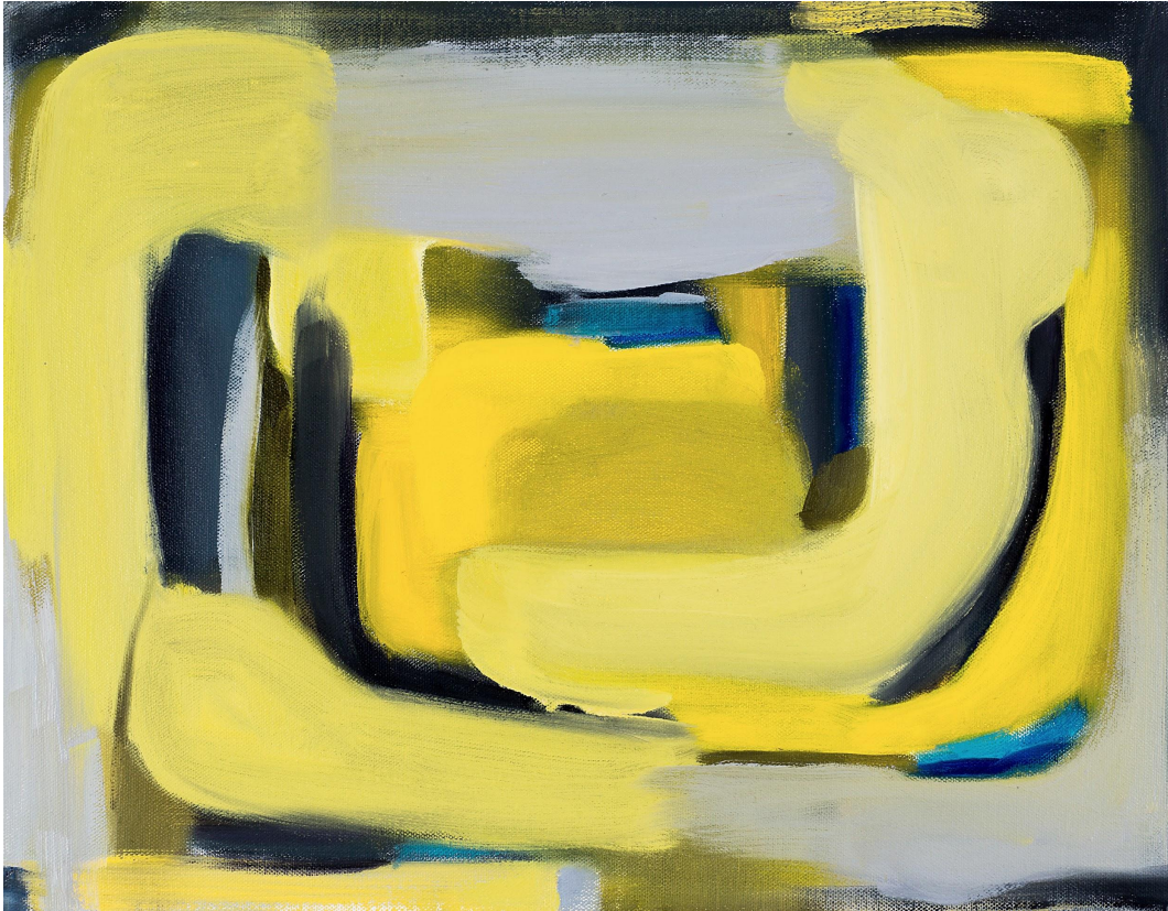
Grace Chun Light and Blinds Oil on Canvas 16 x 20 inch $ 1,600