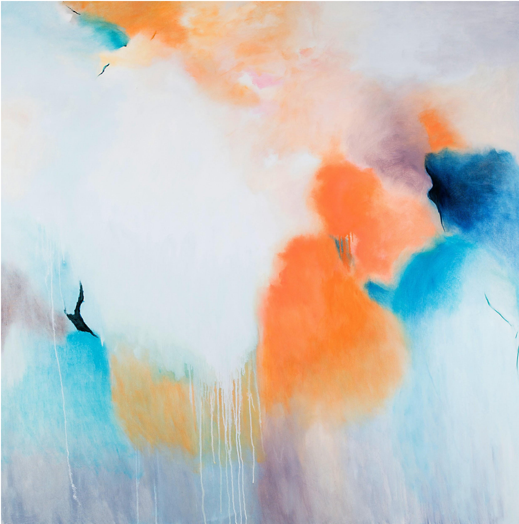
Grace Chun Aeolian Palette #2 Oil on Canvas 60 x 60 inch $ 8,000