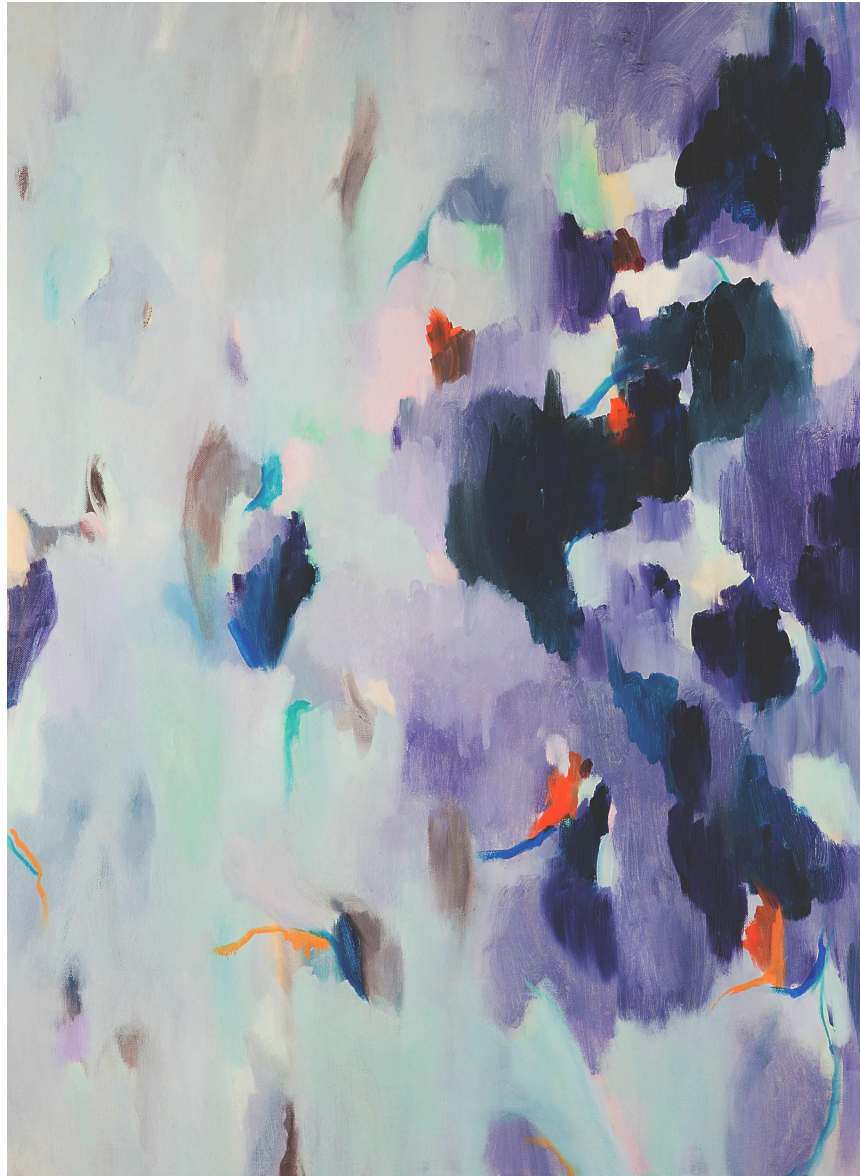
Grace Chun Pointed Poem #2 Oil on Canvas 40 x 30 inch $ 4,000