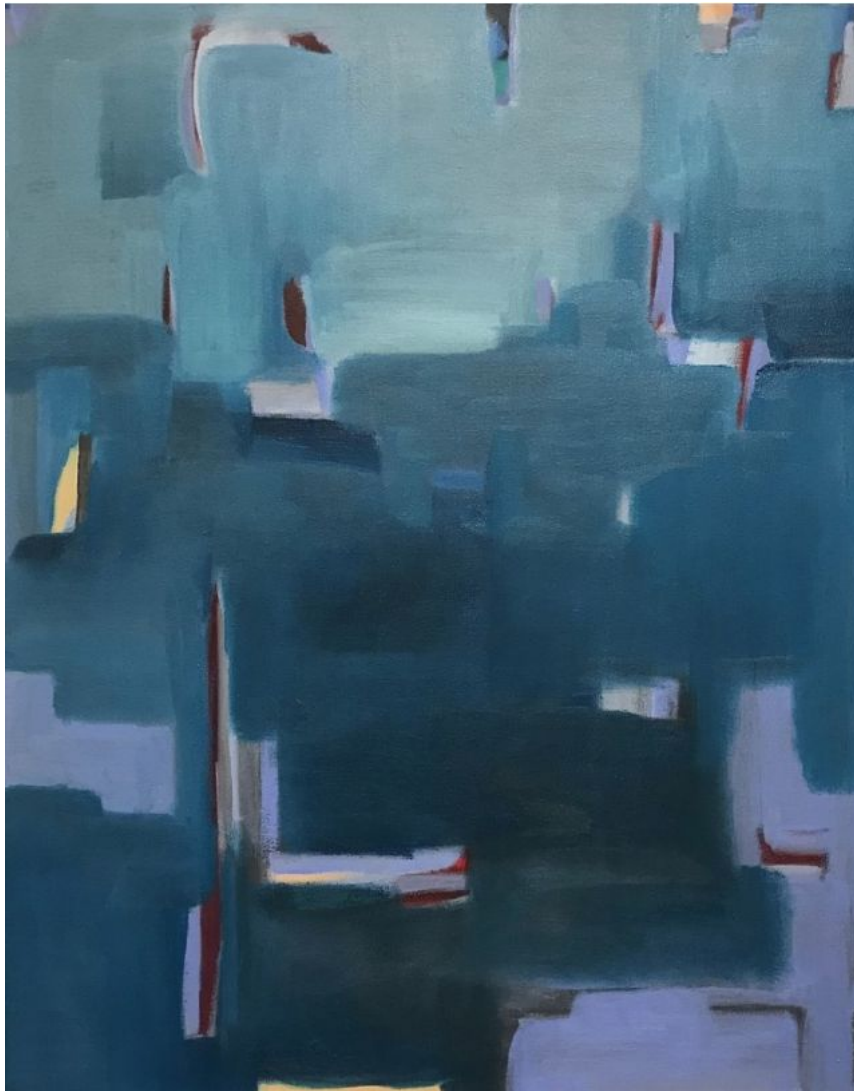
Grace Chun Indigo M Oil on Canvas 30 x 24 inch $ 3,000