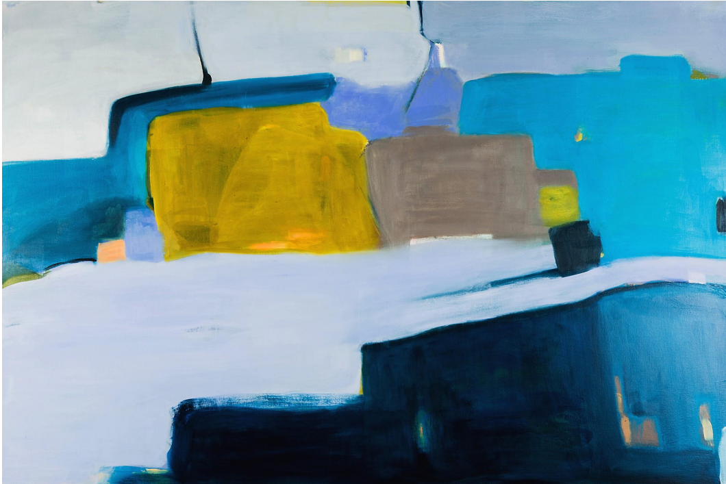
Grace Chun Widening Path Oil on Canvas 40 x 60 inch $ 5,000