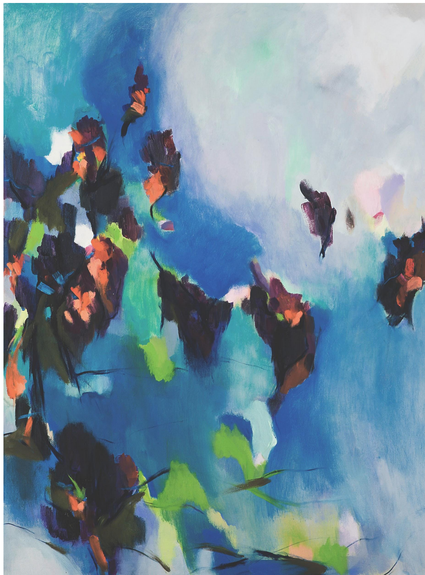
Grace Chun Pointed Poem #3 Oil on Canvas 40 x 30 inch $ 4,000