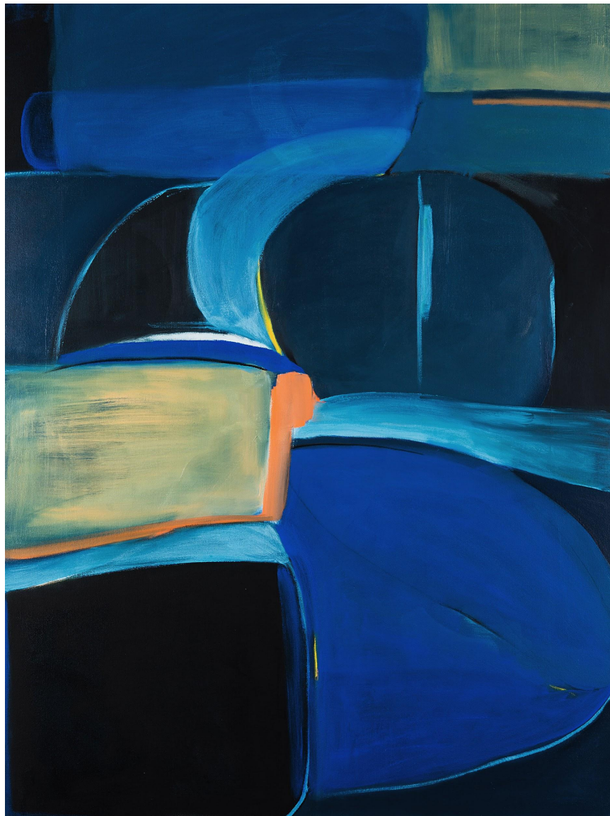
Grace Chun Indigo Mod Oil on Canvas 48 x 30 inch $ 4,000