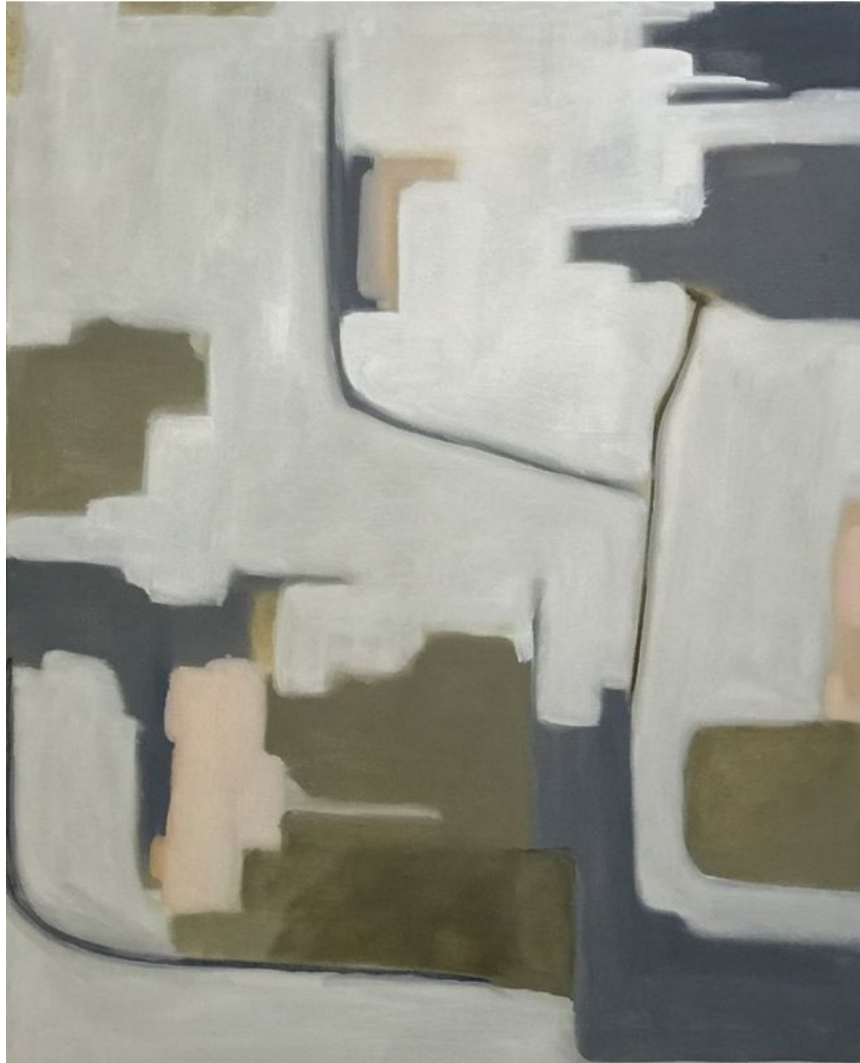
Grace Chun Way to winter Oil on Canvas 30 x 24 inch $ 3,000