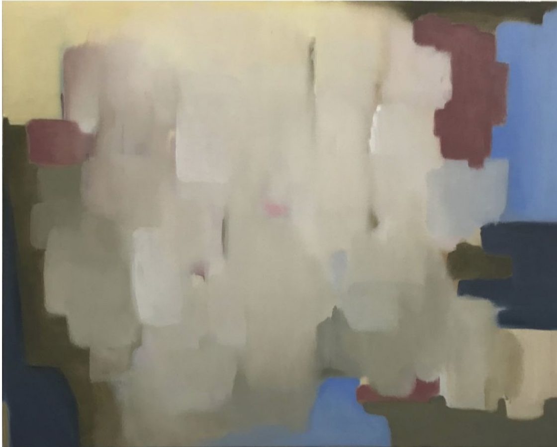
Grace Chun No title Oil on Canvas 24 x 30 inch $ 3,000