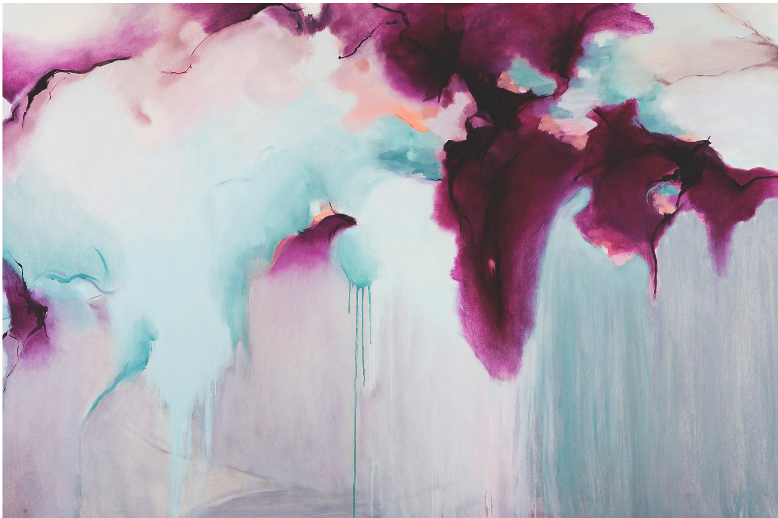
Grace Chun Himinn and Wine Oil on Canvas 48 x 60 inch $ 7,000