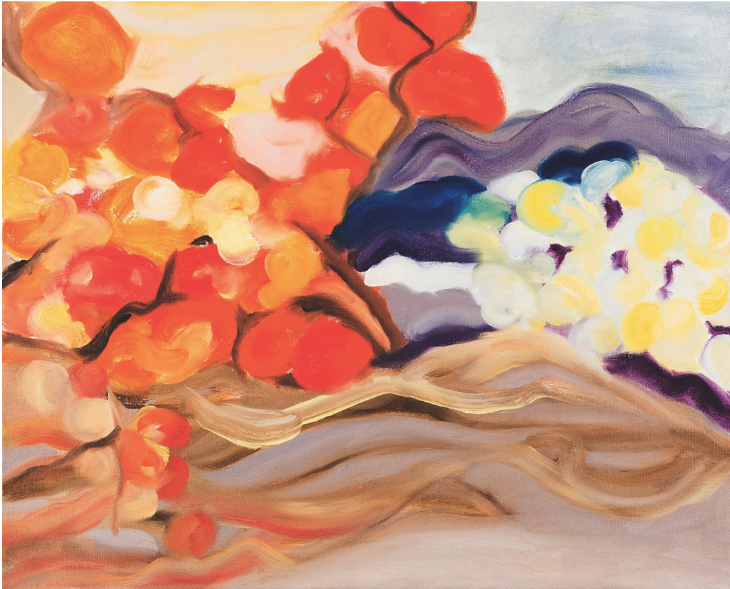
Grace Chun Memory of Autumn Oil on Canvas 24 x 30 inch $ 3,000