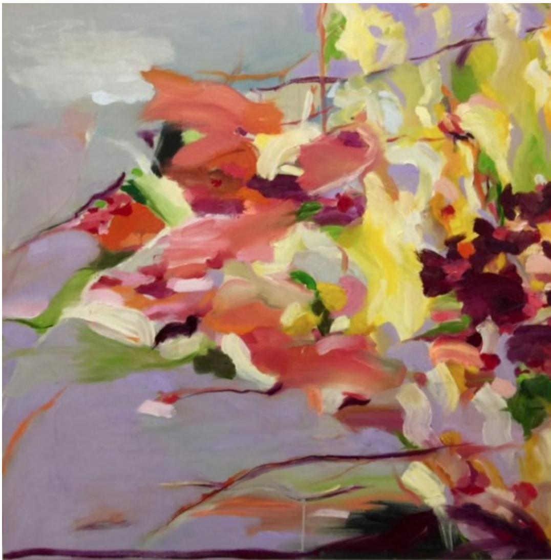
Grace Chun More Than You Know Oil on Canvas 36 x 36 inch $ 4,000