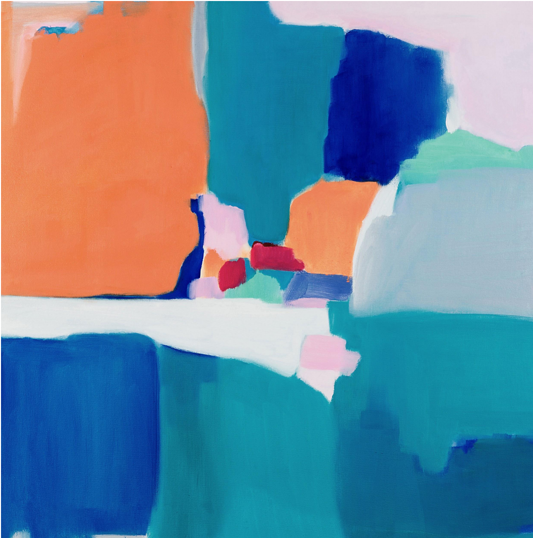
Grace Chun Variations on a Cubit Oil on Canvas 30 x 30 inch $ 3,600