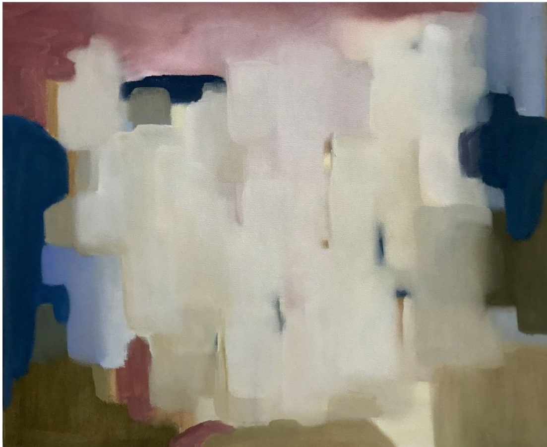
Grace Chun No title Oil on Canvas 24 x 30 inch $ 3,000