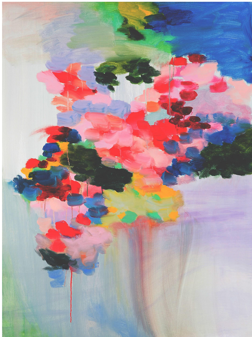
Grace Chun Voices in the Garden Oil on Canvas 40 x 30 inch $ 4,000