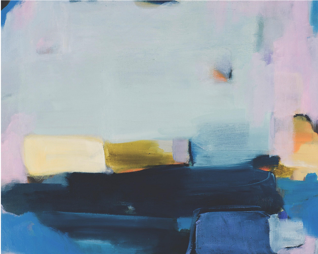
Grace Chun Undiscovered Oil on Canvas 16 x 20 inch $ 1,600