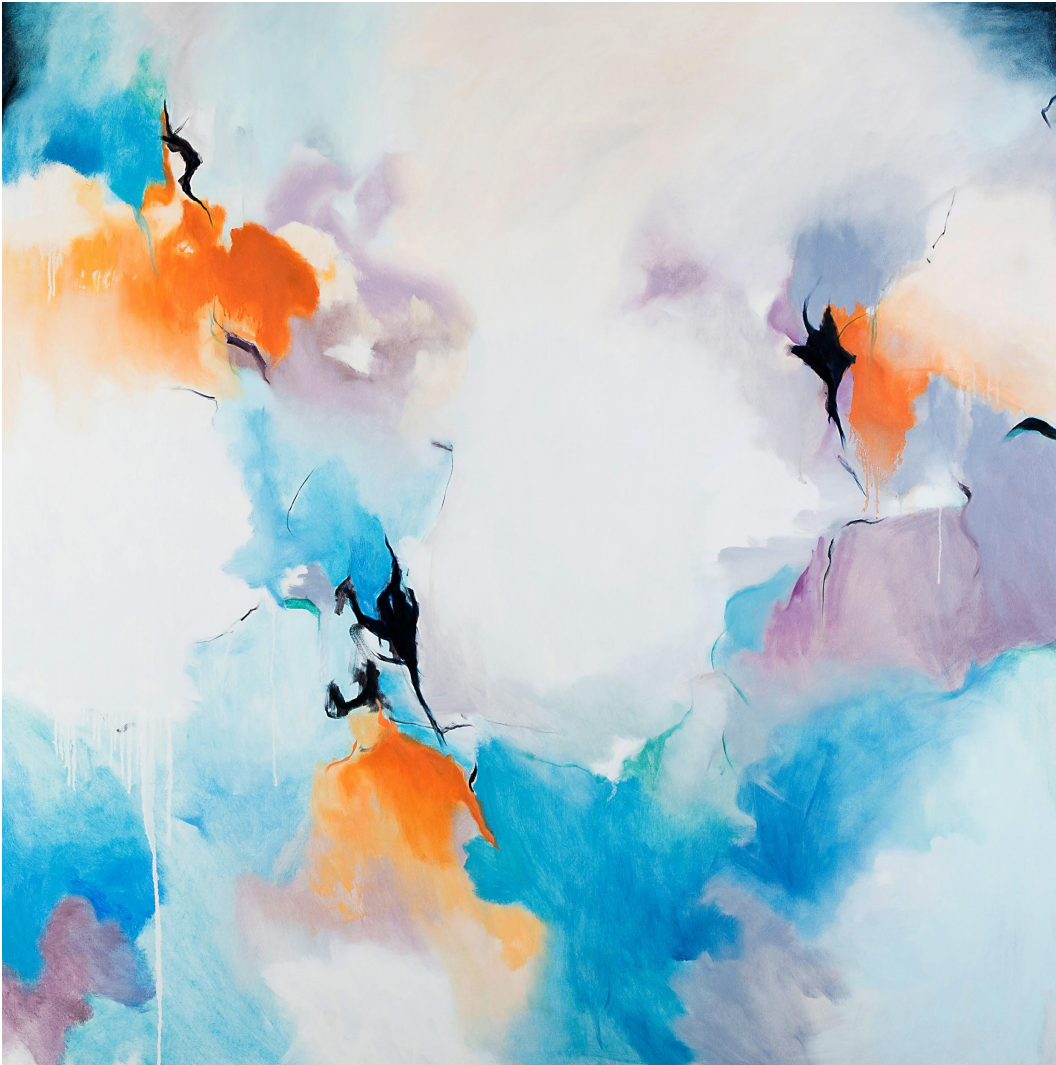
Grace Chun Aeolian Palette Oil on Canvas 60 x 60 inch $ 8,000