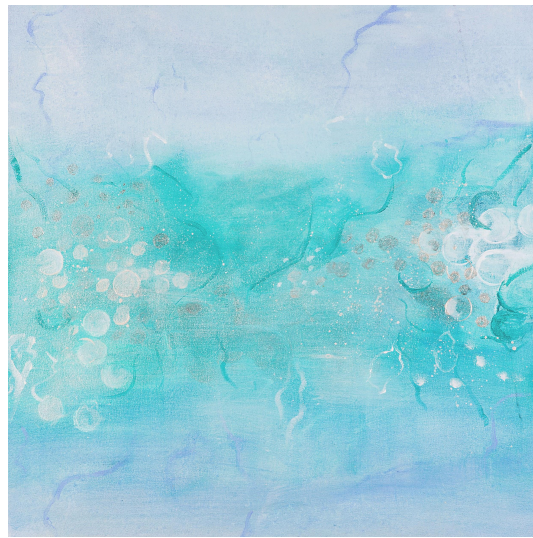
Grace Chun For My Daughter Acrylic on Canvas 24 x 24 inch (each) $ 2,600 (each)