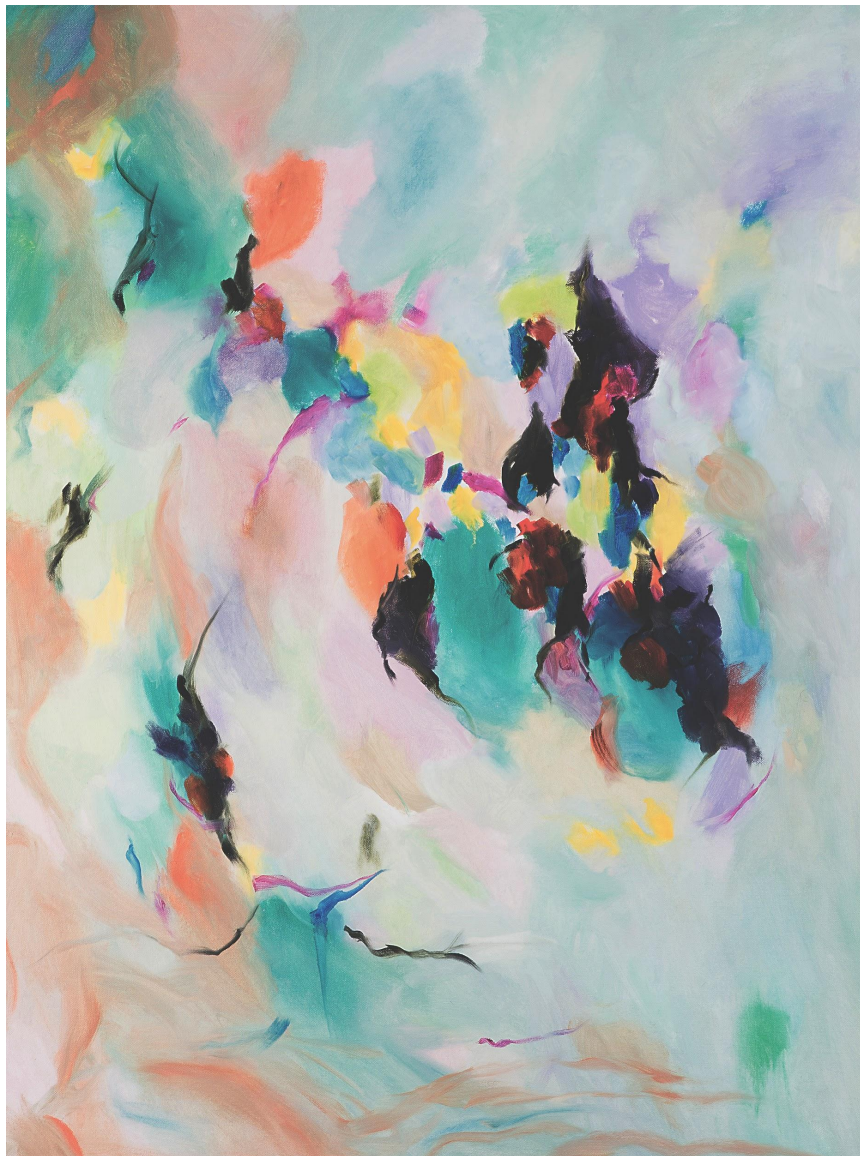
Grace Chun Pointed Poem #1 Oil on Canvas 40 x 30 inch $ 4,000