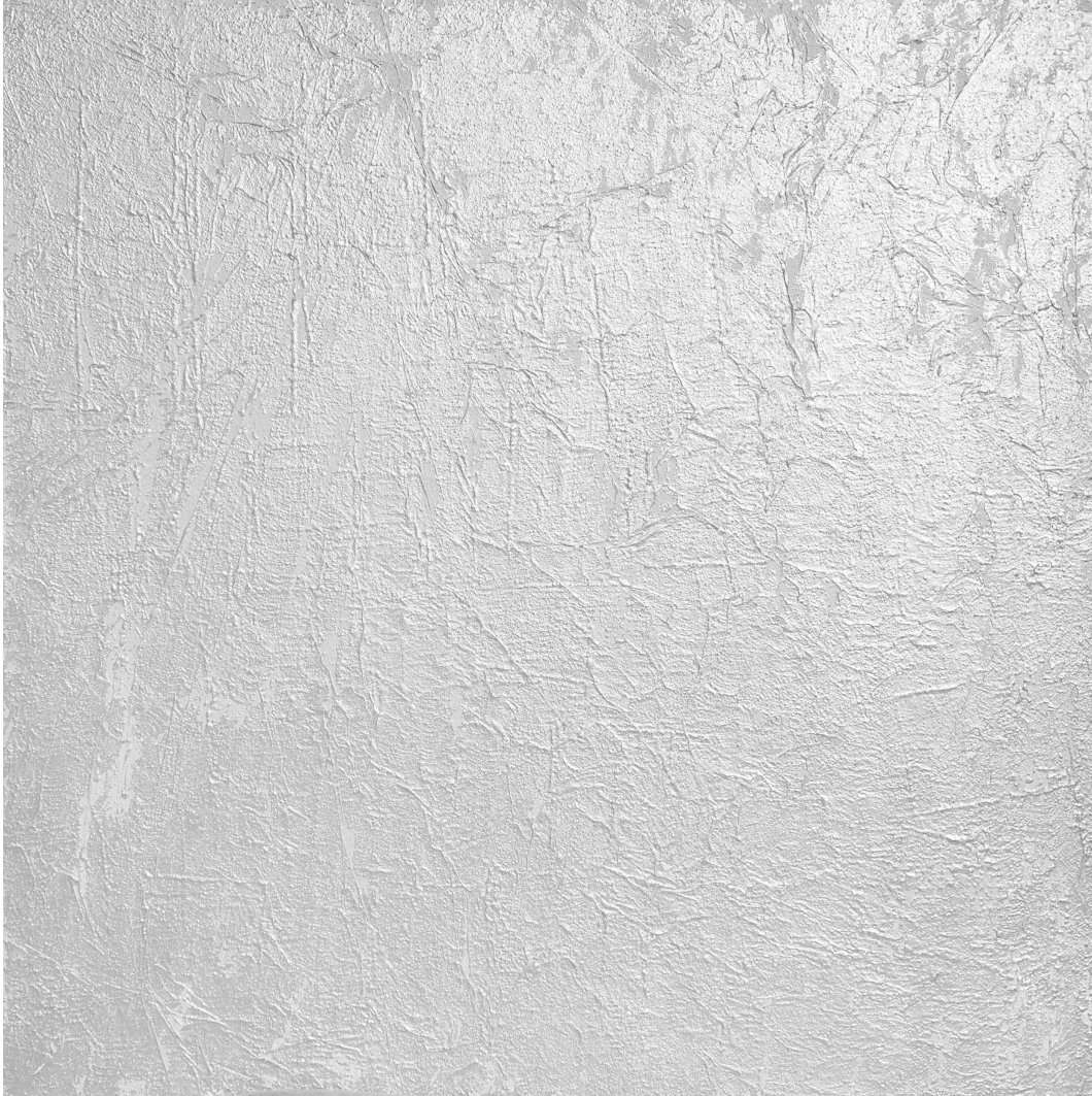
Grace Chun The Lee Mixed media on canvas 36 x 36 inch $ 4,000