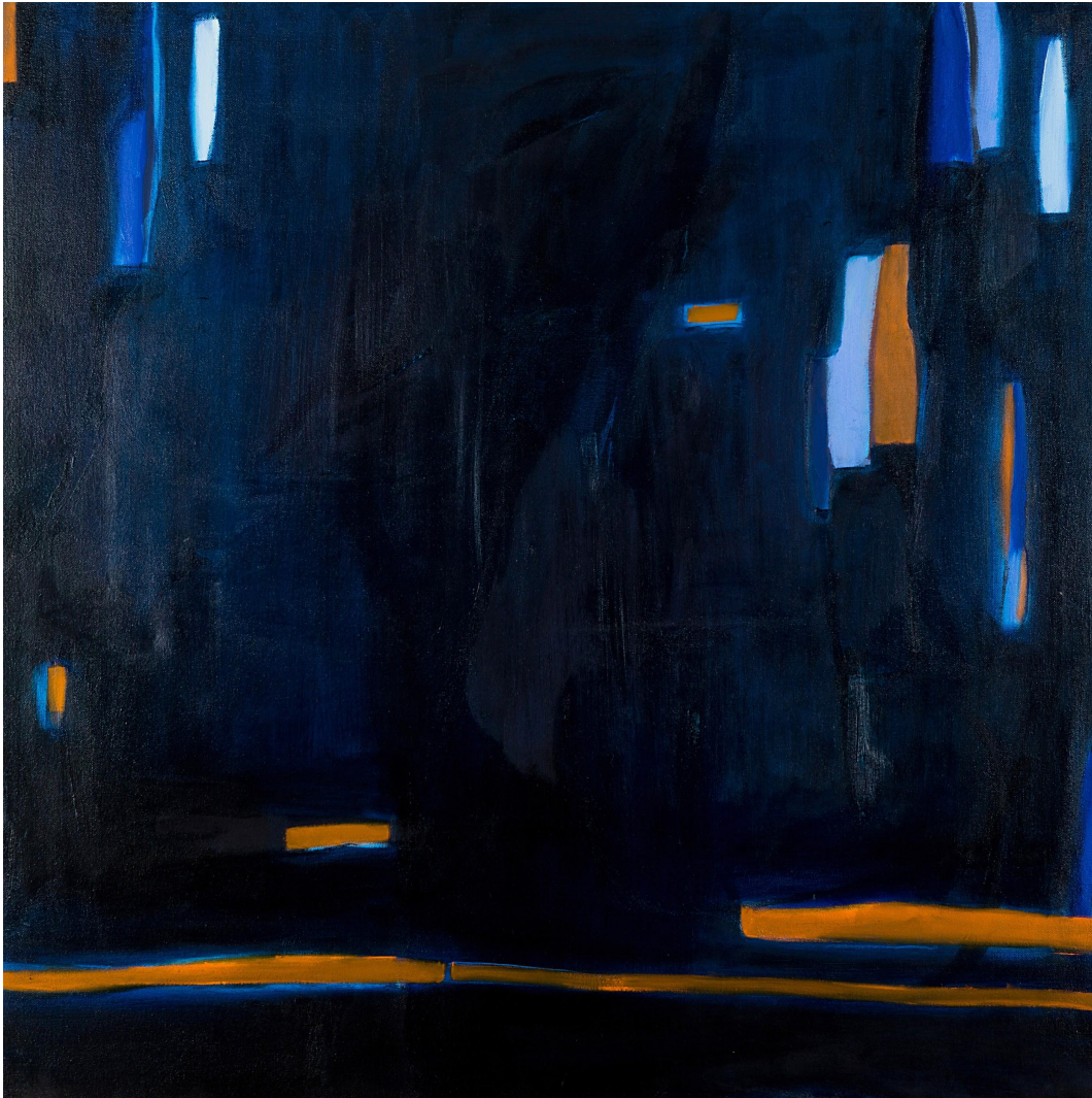
Grace Chun Oriental Blue Oil on Canvas 36 x 36 inch $ 4,000