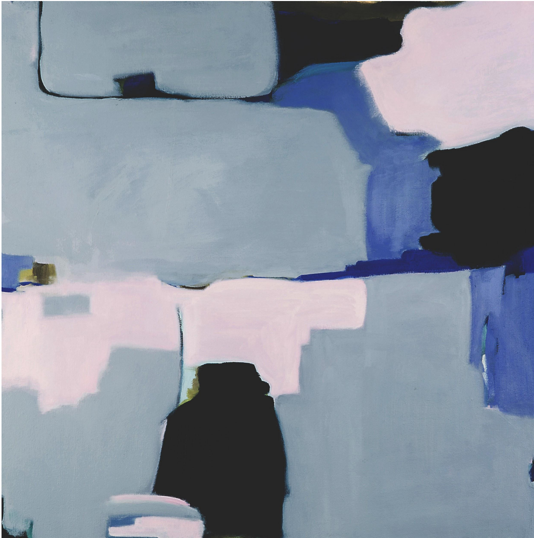
Grace Chun Mood Sensors #2 Oil on Canvas 30 x 30 inch $ 3,600