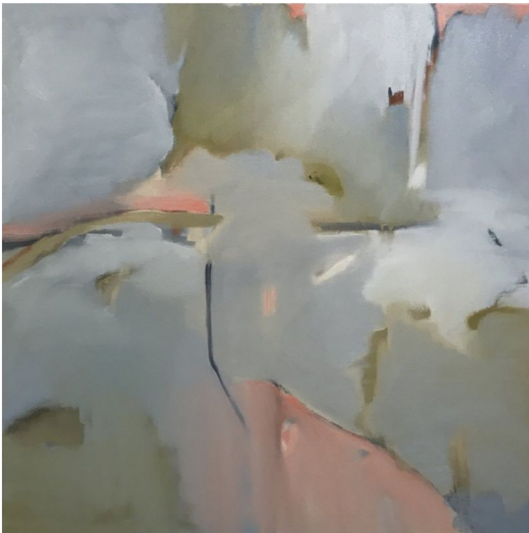
Grace Chun Melba Oil on Canvas 36 x 36 inch $ 4,000