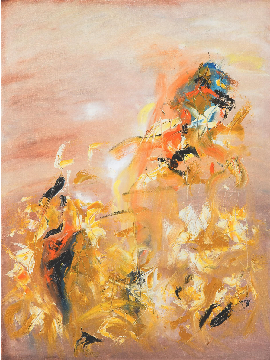
Grace Chun New World Harvest Oil on Canvas 40 x 30 inch $ 4,000