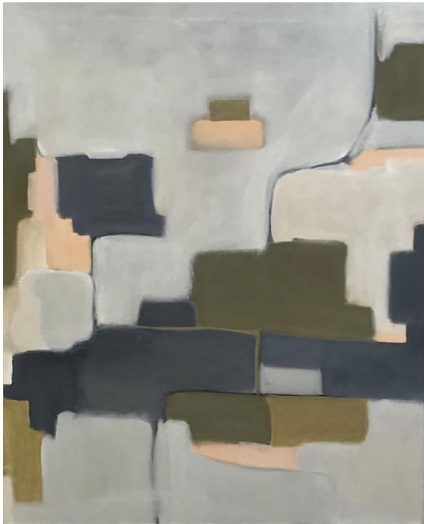
Grace Chun Way to winter #2 Oil on Canvas 30 x 24 inch $ 3,000