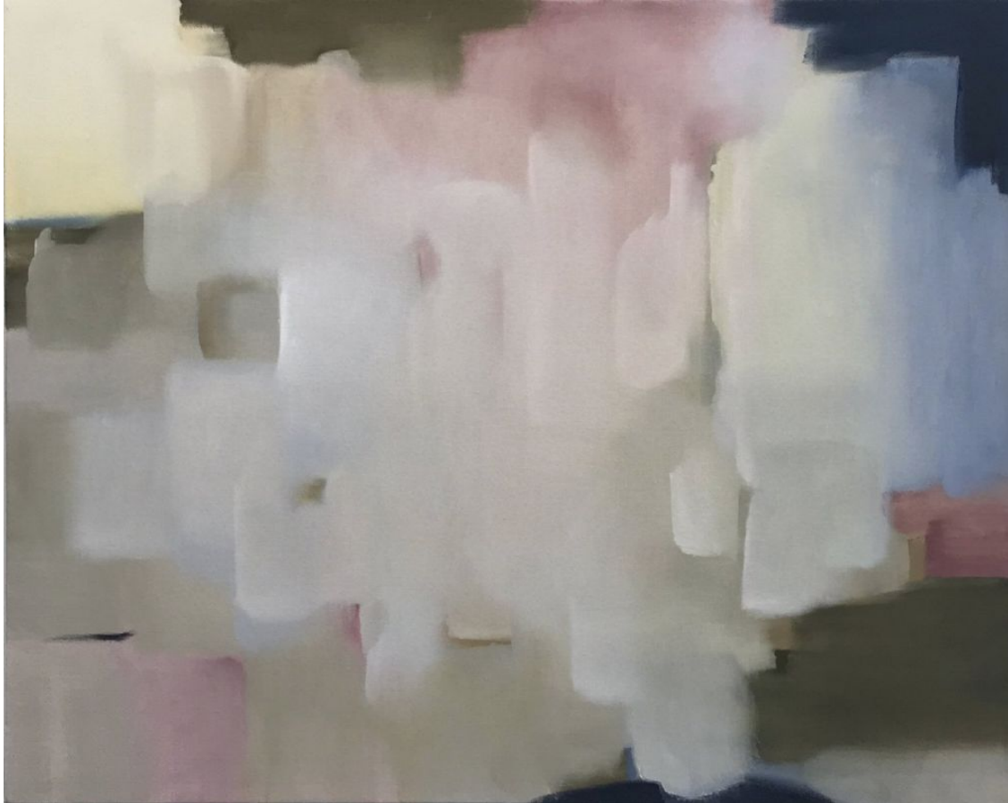
Grace Chun No title Oil on Canvas 24 x 30 inch $ 3,000