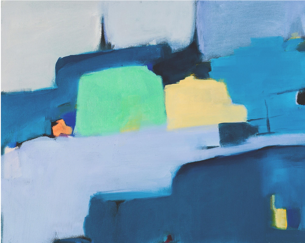
Grace Chun Widening Path #2 Oil on Canvas 16 x 20 inch $ 1,600