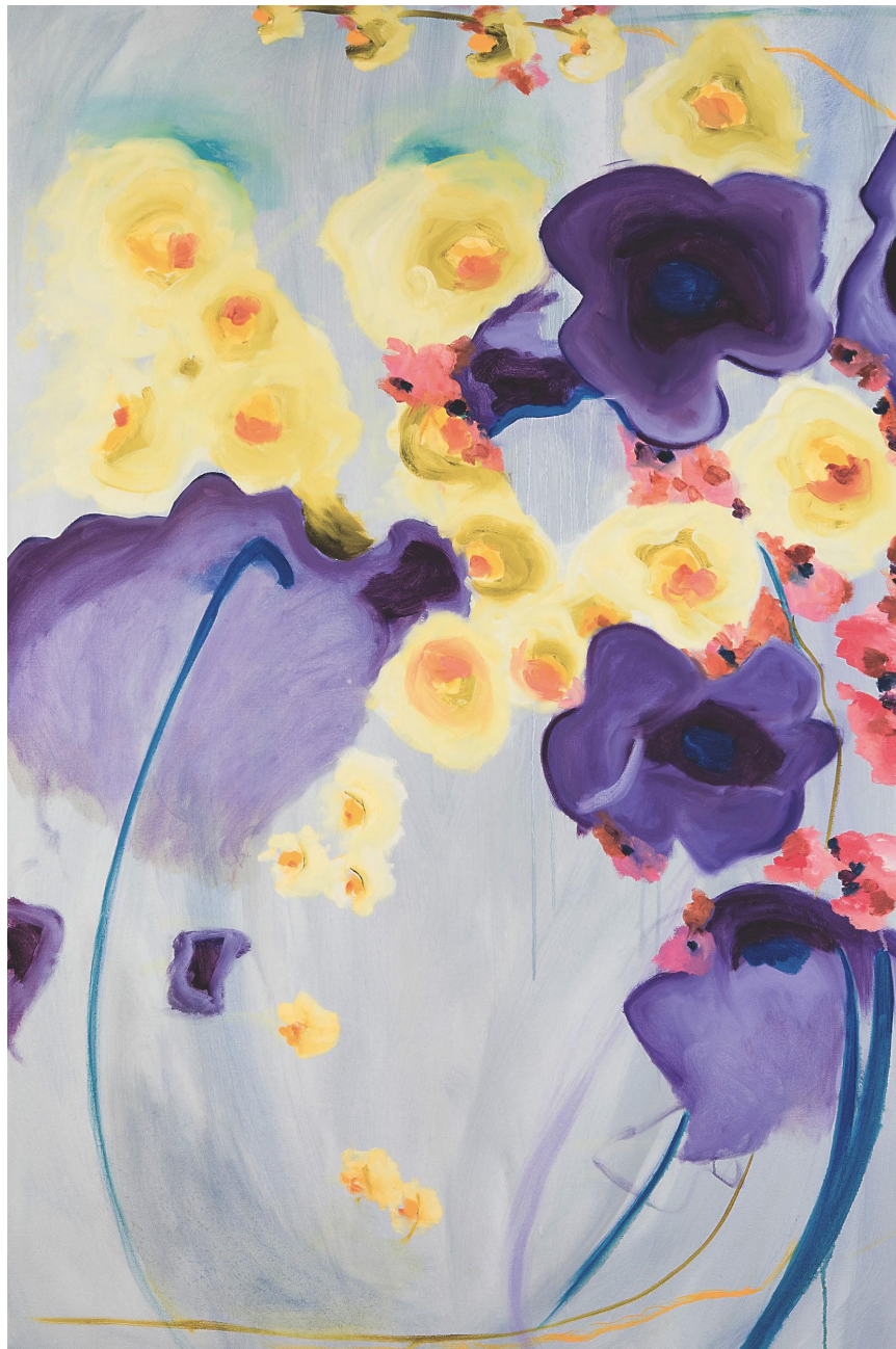
Grace Chun Almost May 1 Oil on Canvas 60 x 40 inch $ 5,000