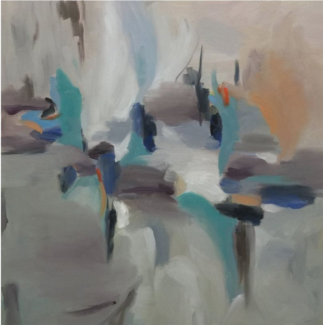
Grace Chun Getting There Oil on Canvas 24 x 24 inch $ 2,600