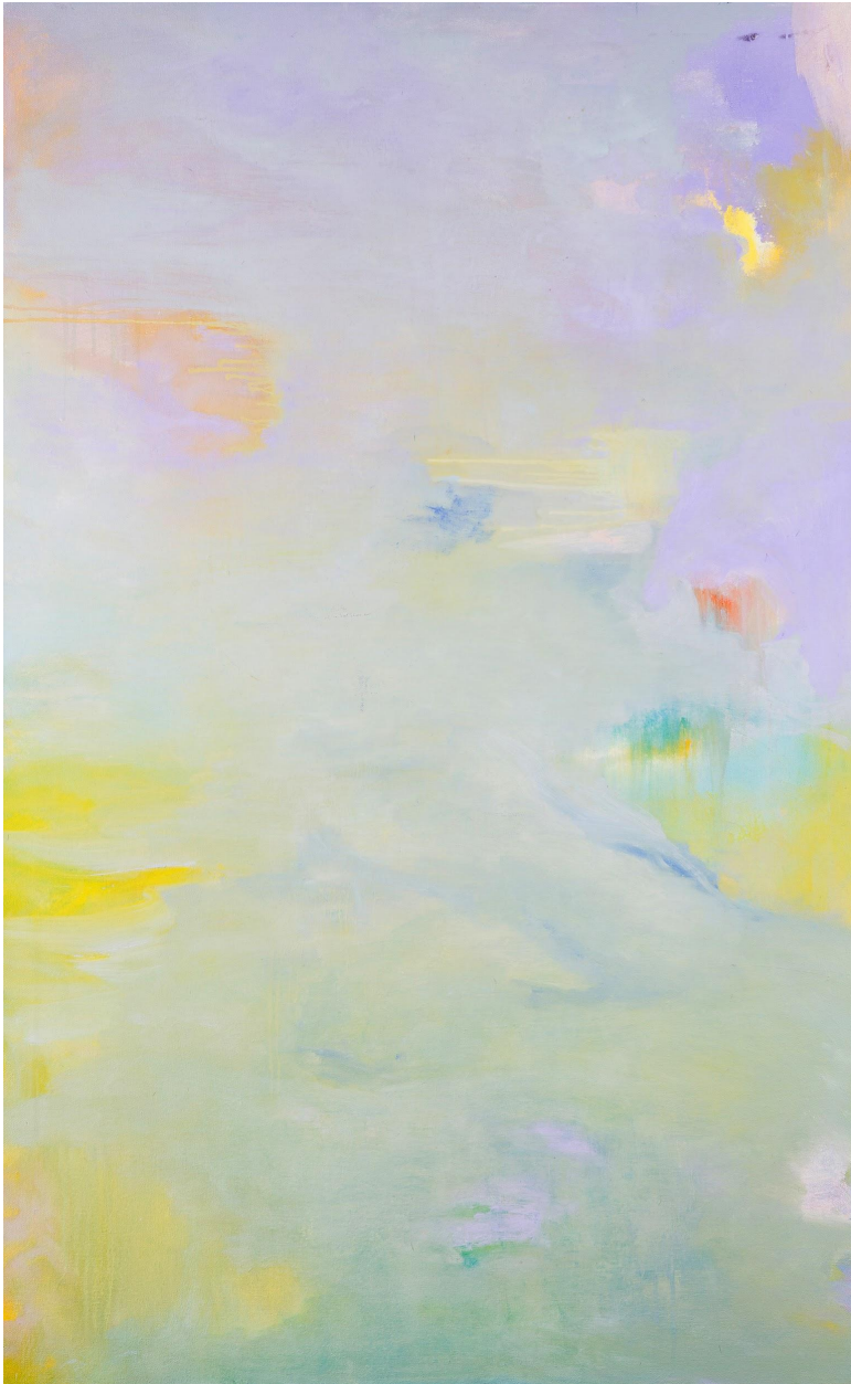
Grace Chun Spring Breathe Oil on Canvas 48 x 30 inch $ 4,000