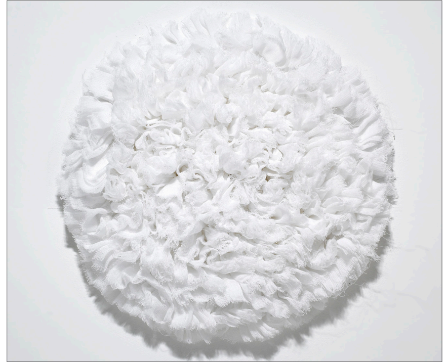
White Dream , 2017, white bandages, diameter 19.6 inches

Lee purchased many of plaster bandage in order to create visual artworks. Soaking the material in the water and attaching it on a board at the same time creating wave shapes is very meditative processing and labor intensive because the artist shouldn't stop until one roll or bandage finished. Attaching plaster bandage with creates shadows is very tricky and complicated process. Finally, Various shadows on white plaster bandages become another beautiful abstract three-dimensional-painting.