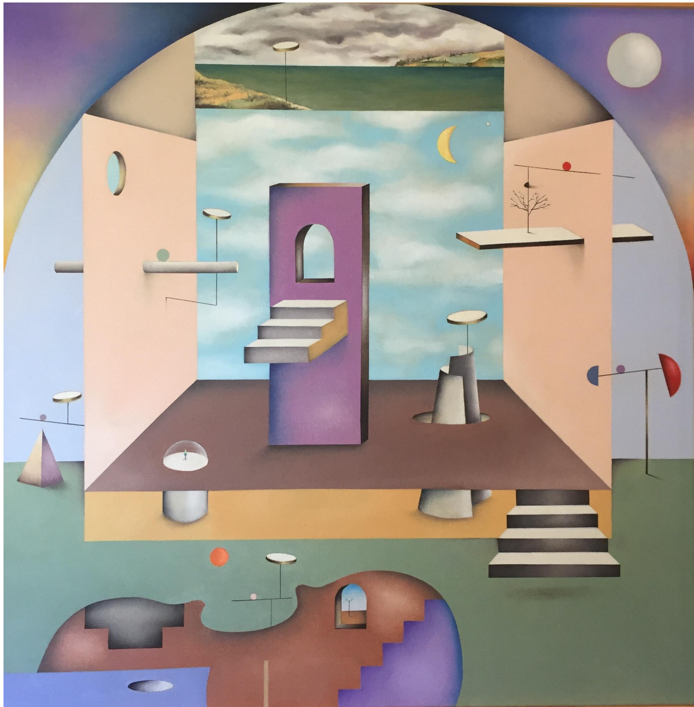
Jeffrey Melzack To Sleep Perhaps To Dream 2019 Oil on canvas 24 x 24 inches $2,500