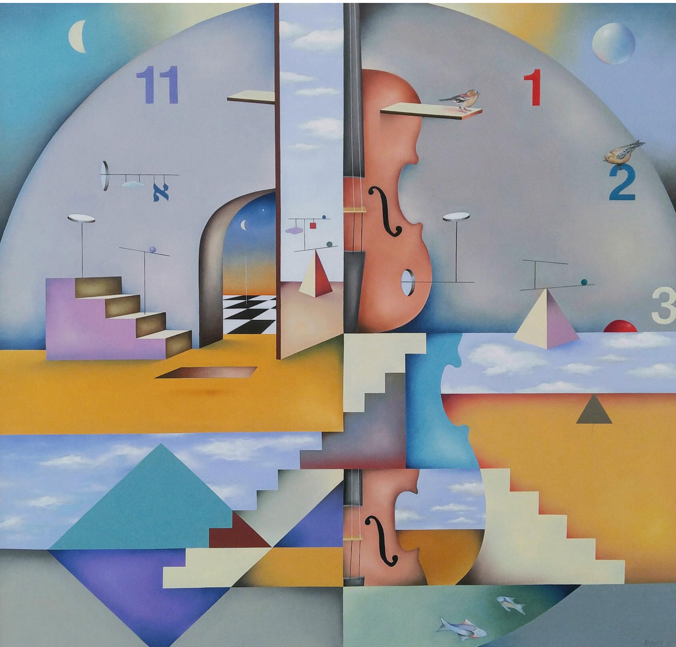
Jeffrey Melzack Throughout Time and Here Eternally , 2017 Oil on canvas 36 x 36 inches $ 6,500 KR