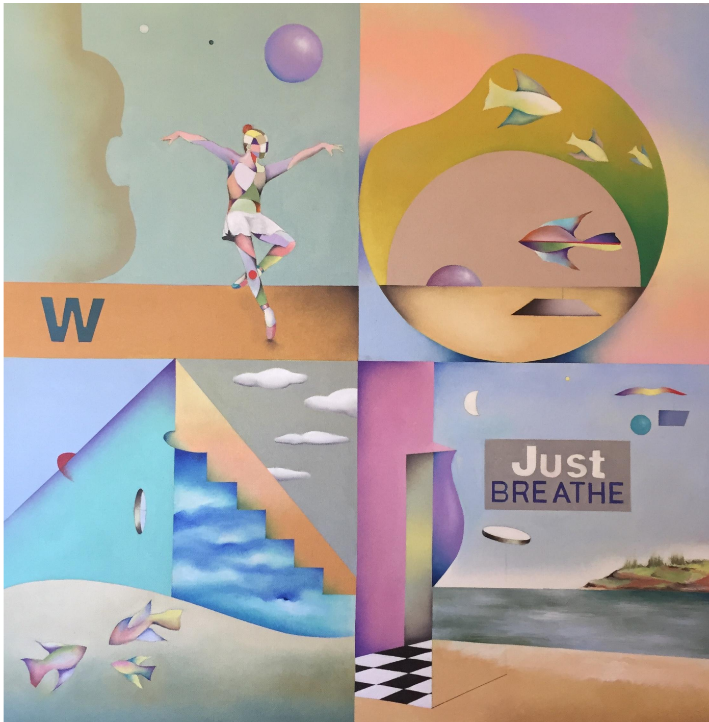
Jeffrey Melzack Divine introspection, She Who Looks Within 2019 Oil on canvas 24 x 24 inches $ 2,500