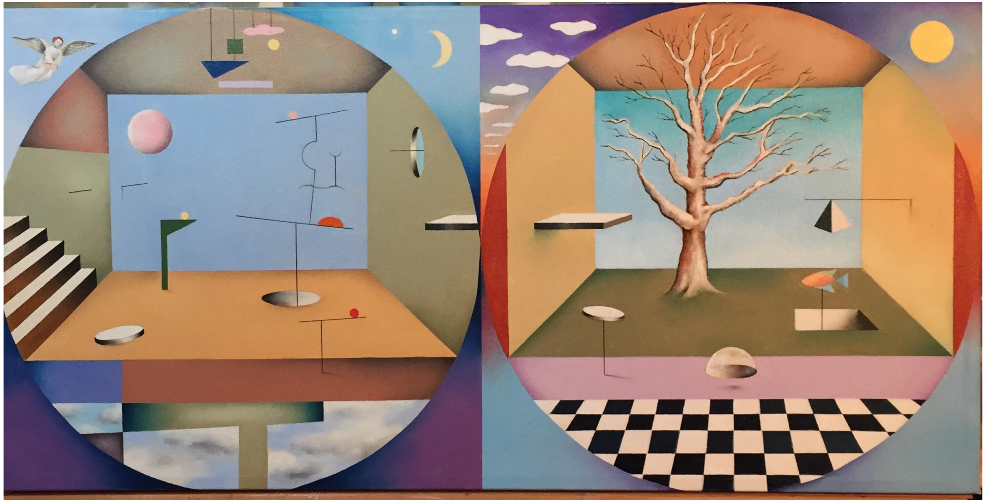
Jeffrey Melzack Oh Dreamer, Awake! 2019 Oil on canvas 12 x 24 inches $1,500