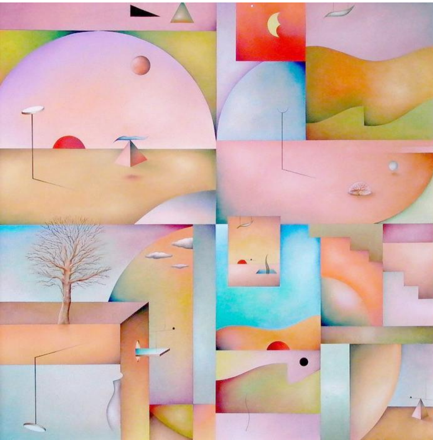
Jeffrey Melzack We Are After All One Soul, One Mind , 2008 Oil on canvas 30 x 30 inches $ 3,500 KR