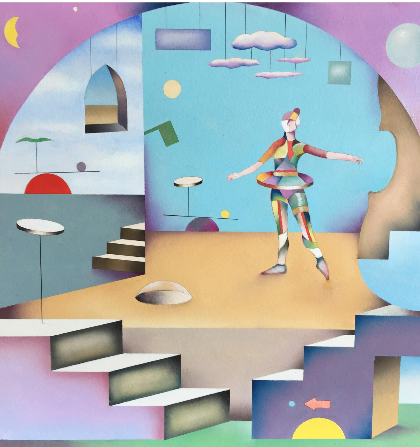
Jeffrey Melzack Etude , 2018 Oil on canvas 12 x 12 inches $1,000