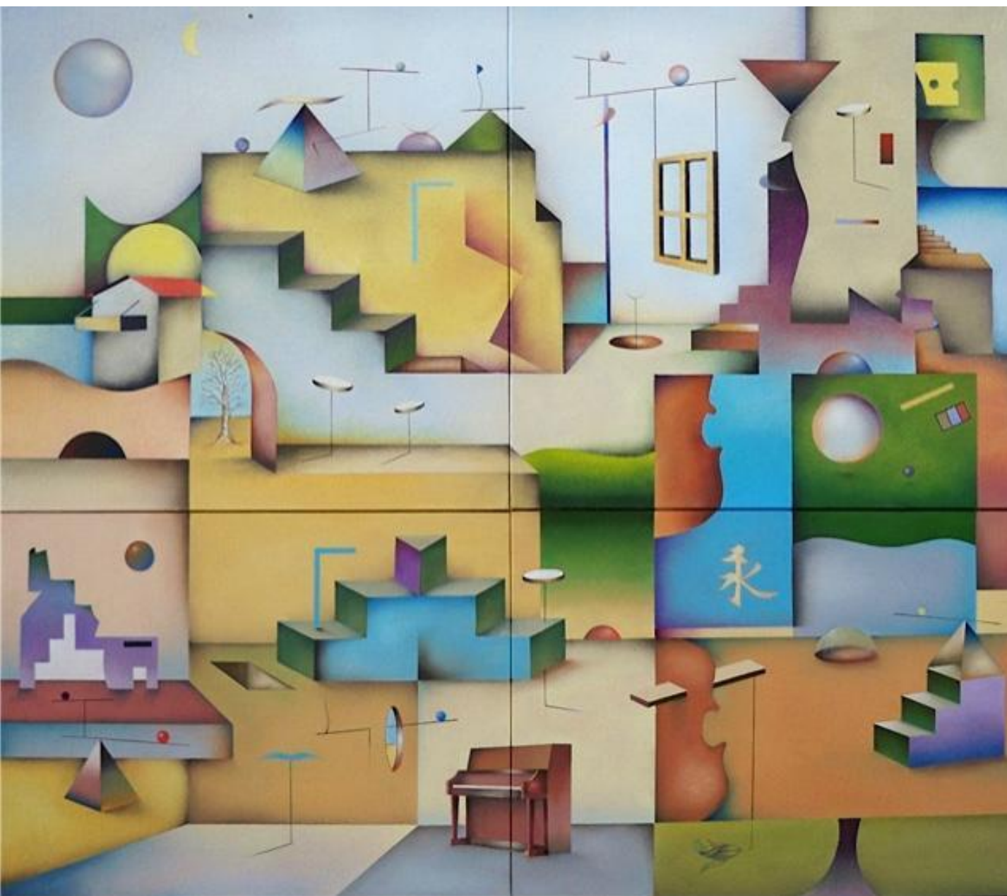
Jeffrey Melzack Inscape Architecture , 2014 Oil on canvas 22 x 25 inches $ 3,000