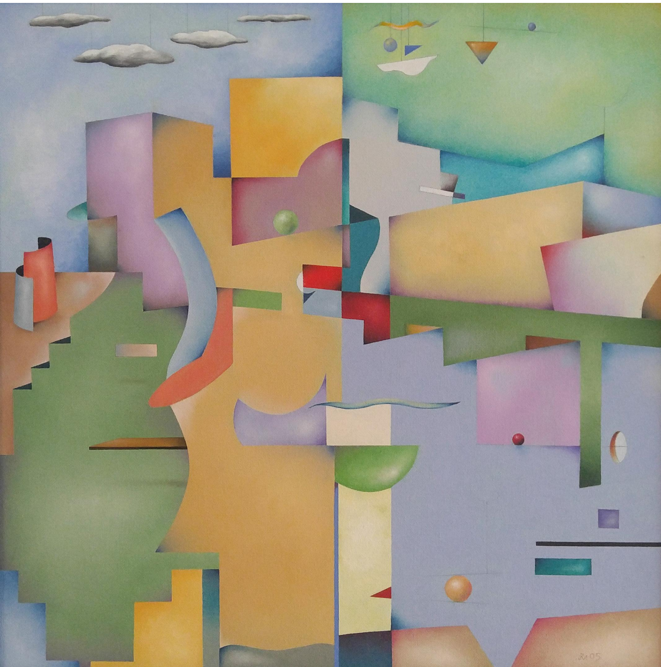
Jeffrey Melzack Street Song Harmony , 2005 Oil on canvas 20 x 20 inches $ 2,500