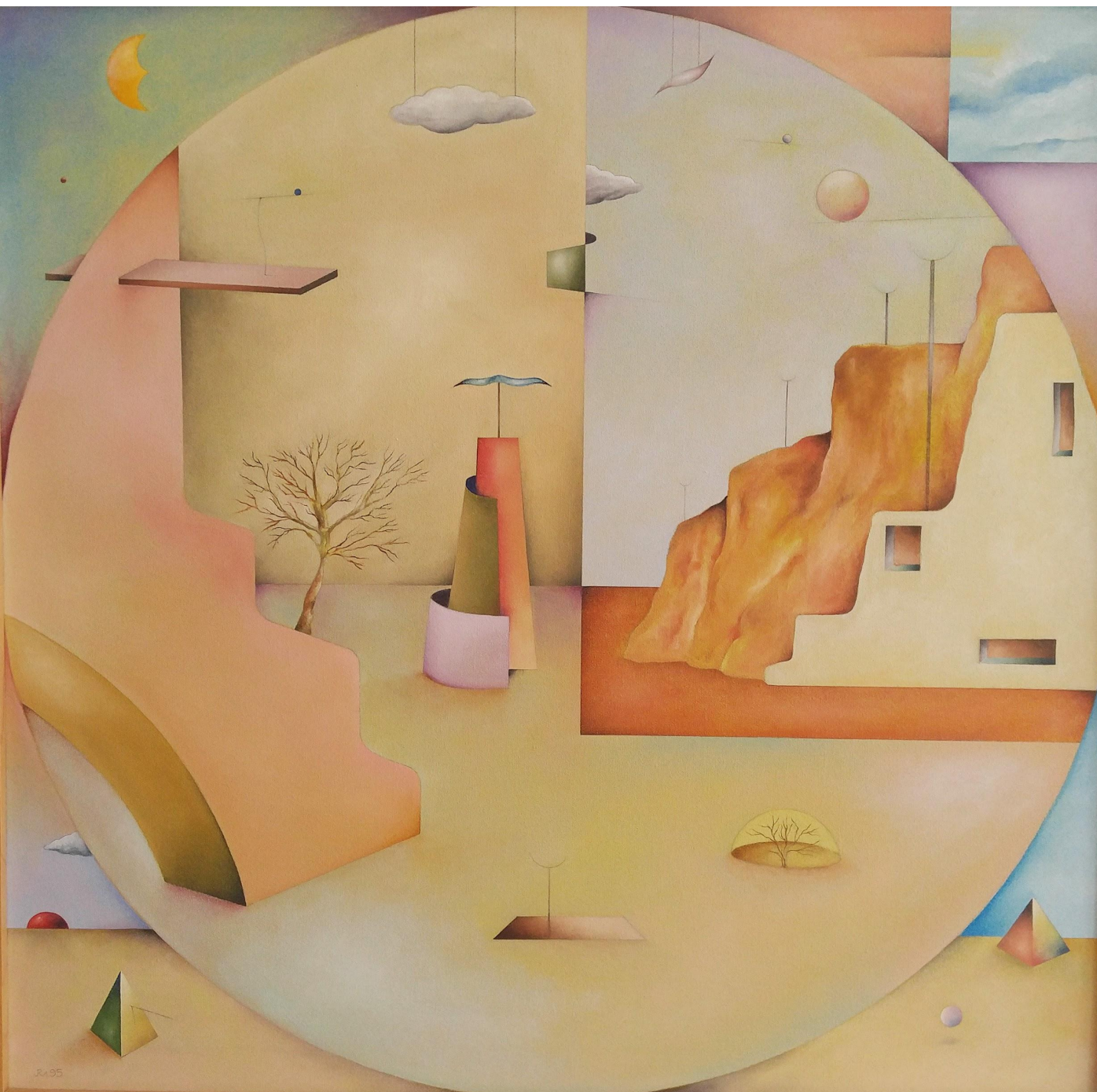
Jeffrey Melzack Sacred Obligation , 1995 Oil on canvas 40 x 30 inches $ 3,500 KR