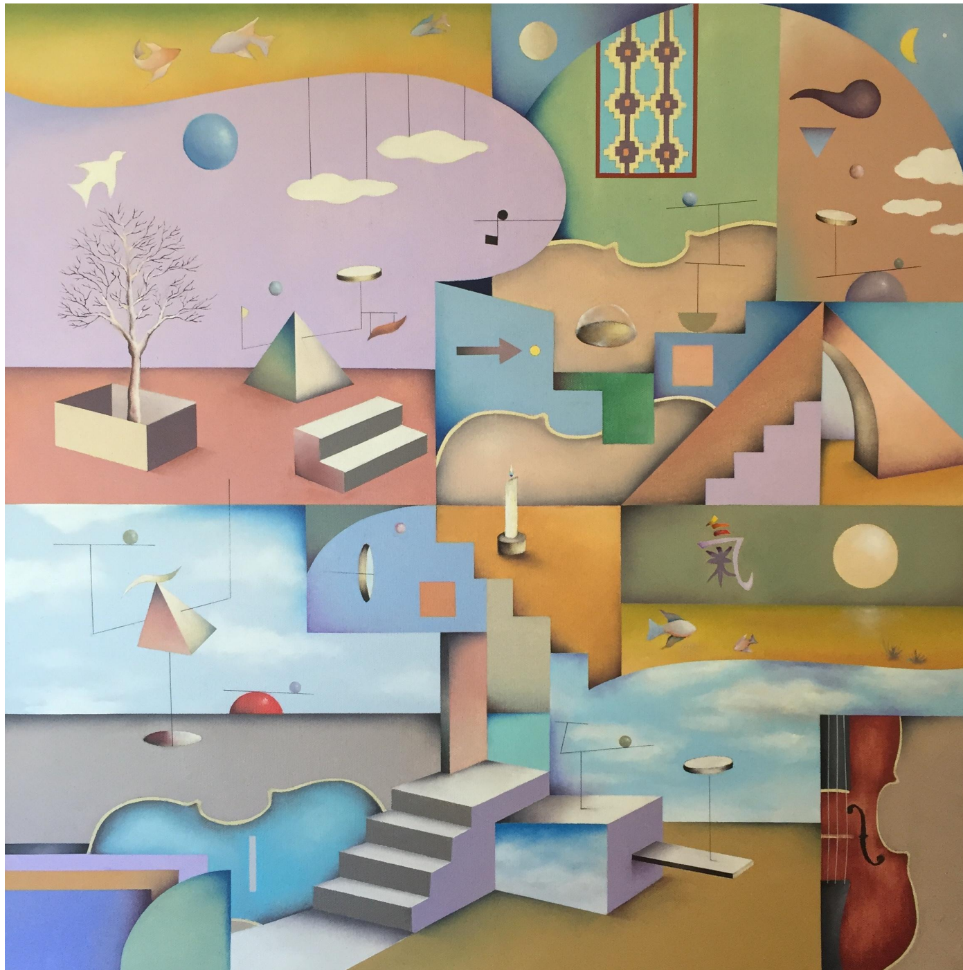
Jeffrey Melzack The Mythology of Perfection 2019 Oil on canvas 24 x 24 inches $2,500