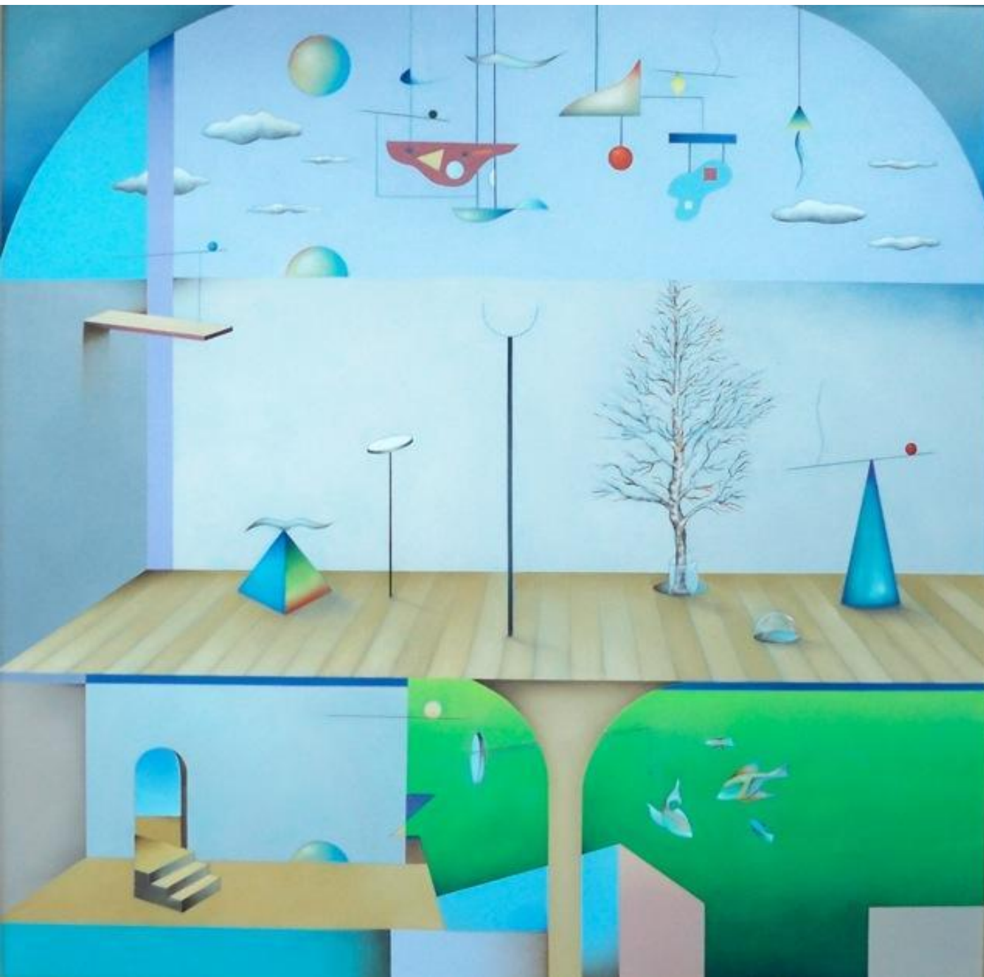
Jeffrey Melzack Matinee , 2009 Oil on canvas 30 x 30 inches $ 3,500 NJ