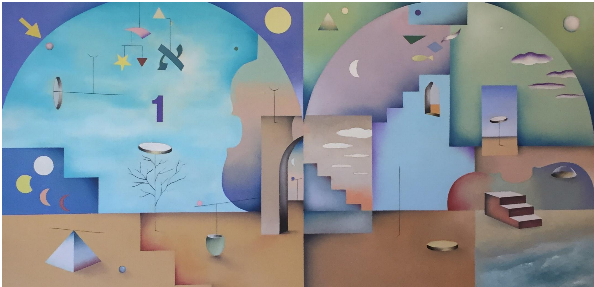
Jeffrey Melzack Koyaanisqatsi, Life Out of Balance 2019 Oil on canvas 15 x 30 inches $2,000