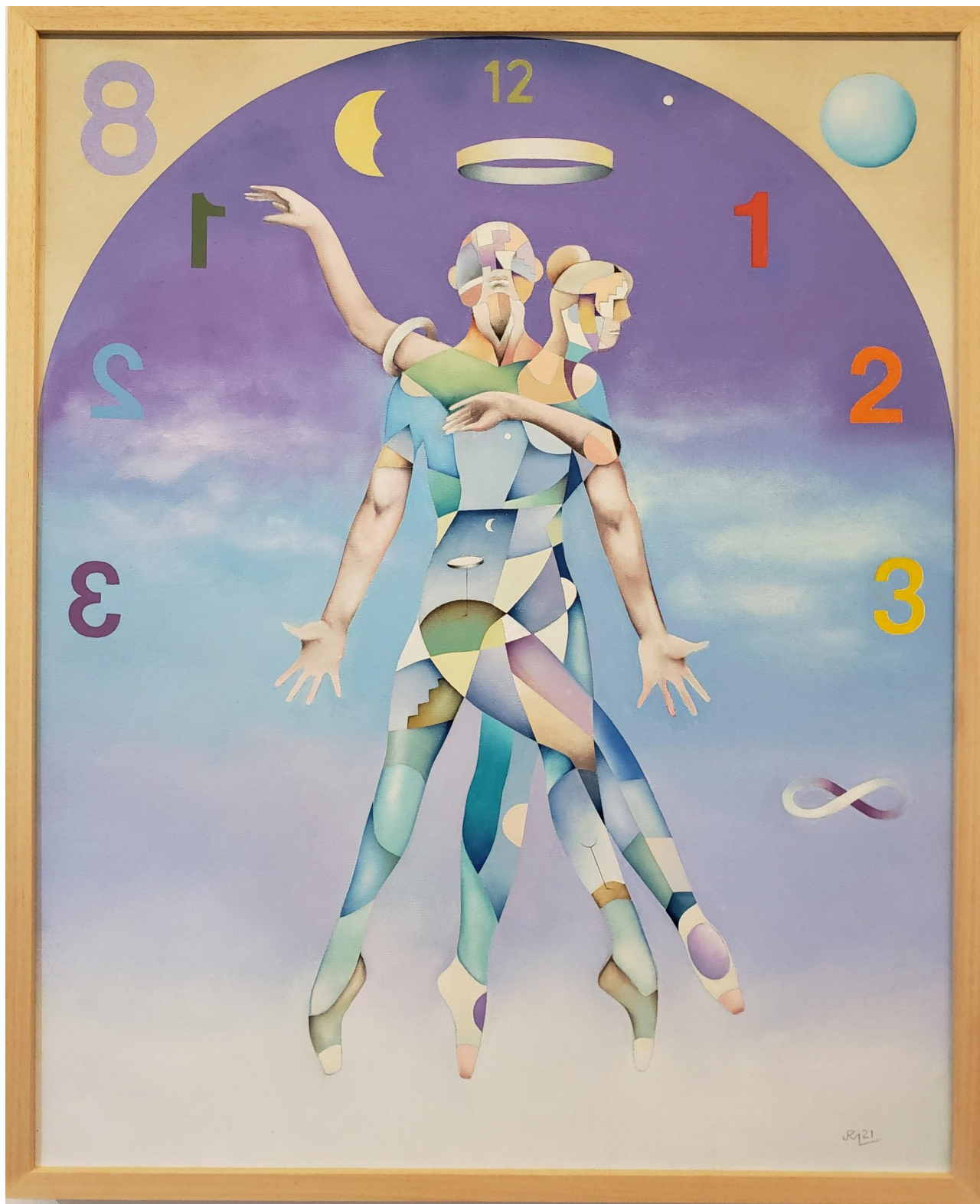
Jeffrey Melzack Dybbik-An East Side Story 2021 Oil on canvas 18 x 36 inches $ 2,500