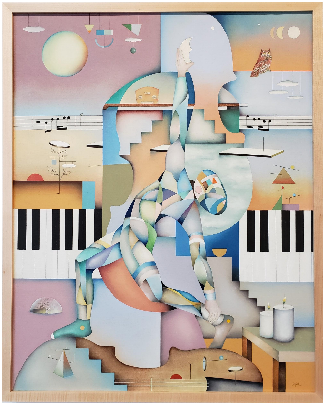
Jeffrey Melzack Nocturne for Violin and Piano 2021 Oil on canvas 24 x 30 inches $ 3,200