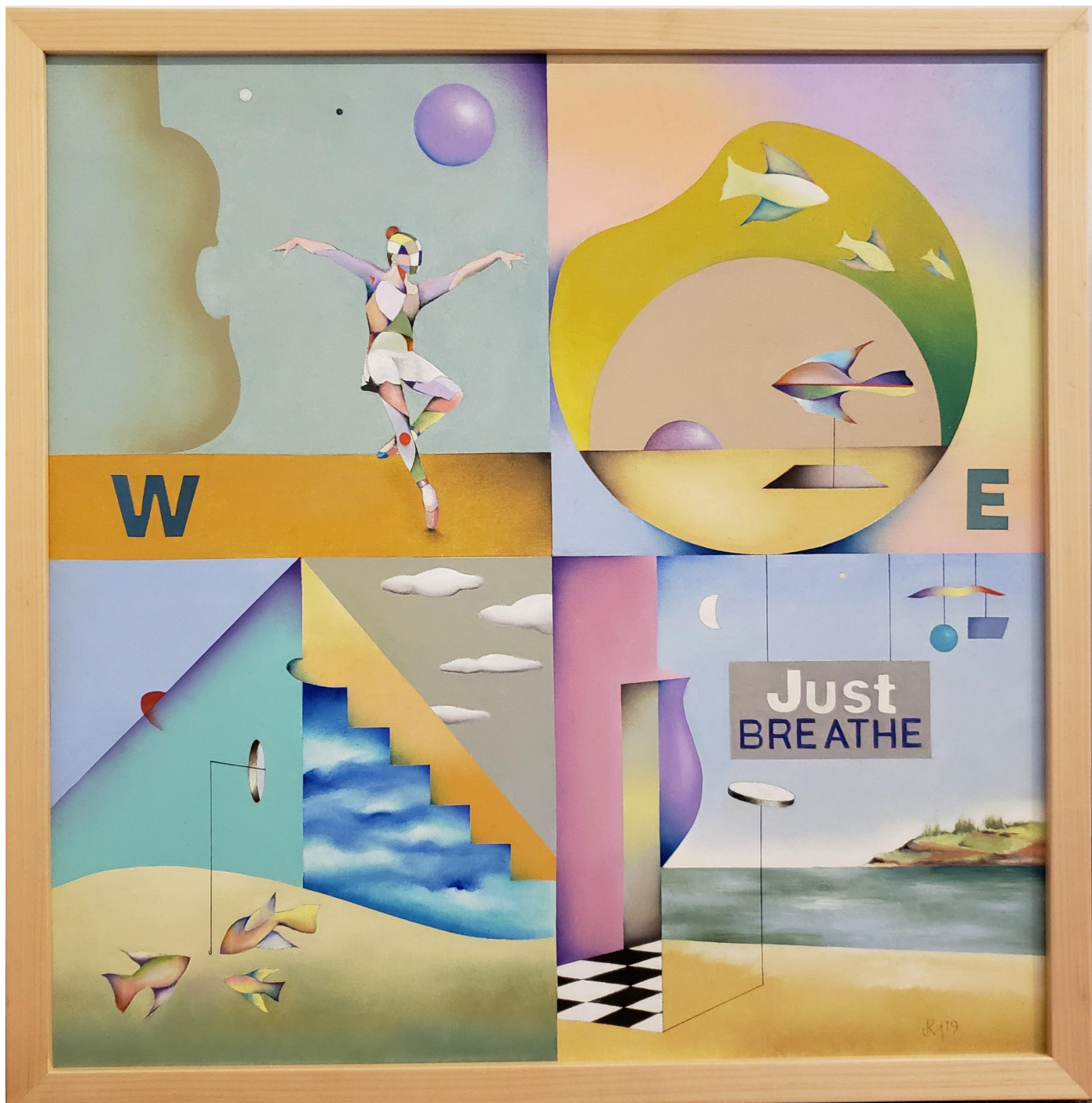
Jeffrey Melzack Divine introspection, She Who Looks Within 2019 Oil on canvas 24 x 24 inches $ 2,500