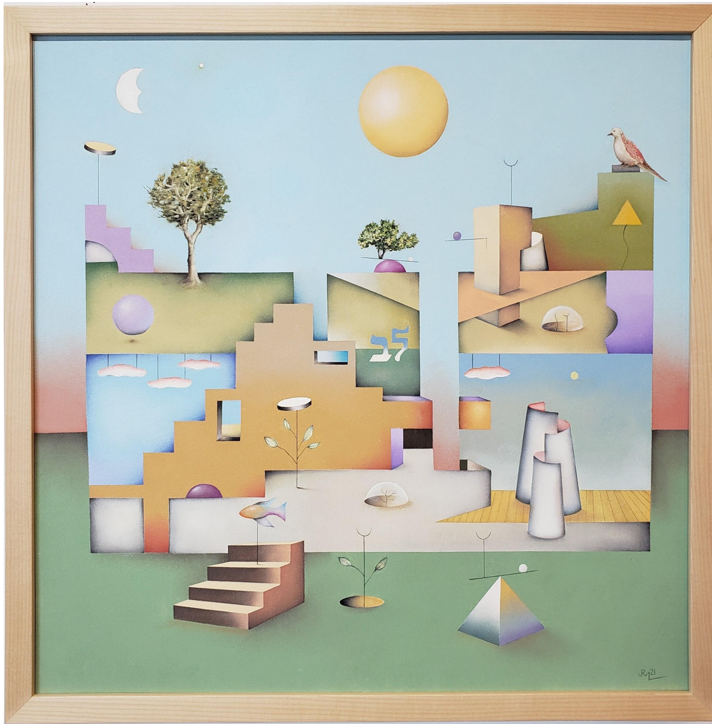
Jeffrey Melzack Finding 2021 Oil on canvas 24 x 24 inches $ 2,400