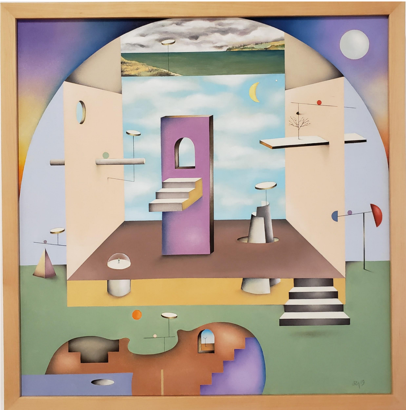
Jeffrey Melzack To Sleep Perhaps To Dream 2019 Oil on canvas 24 x 24 inches $2,500