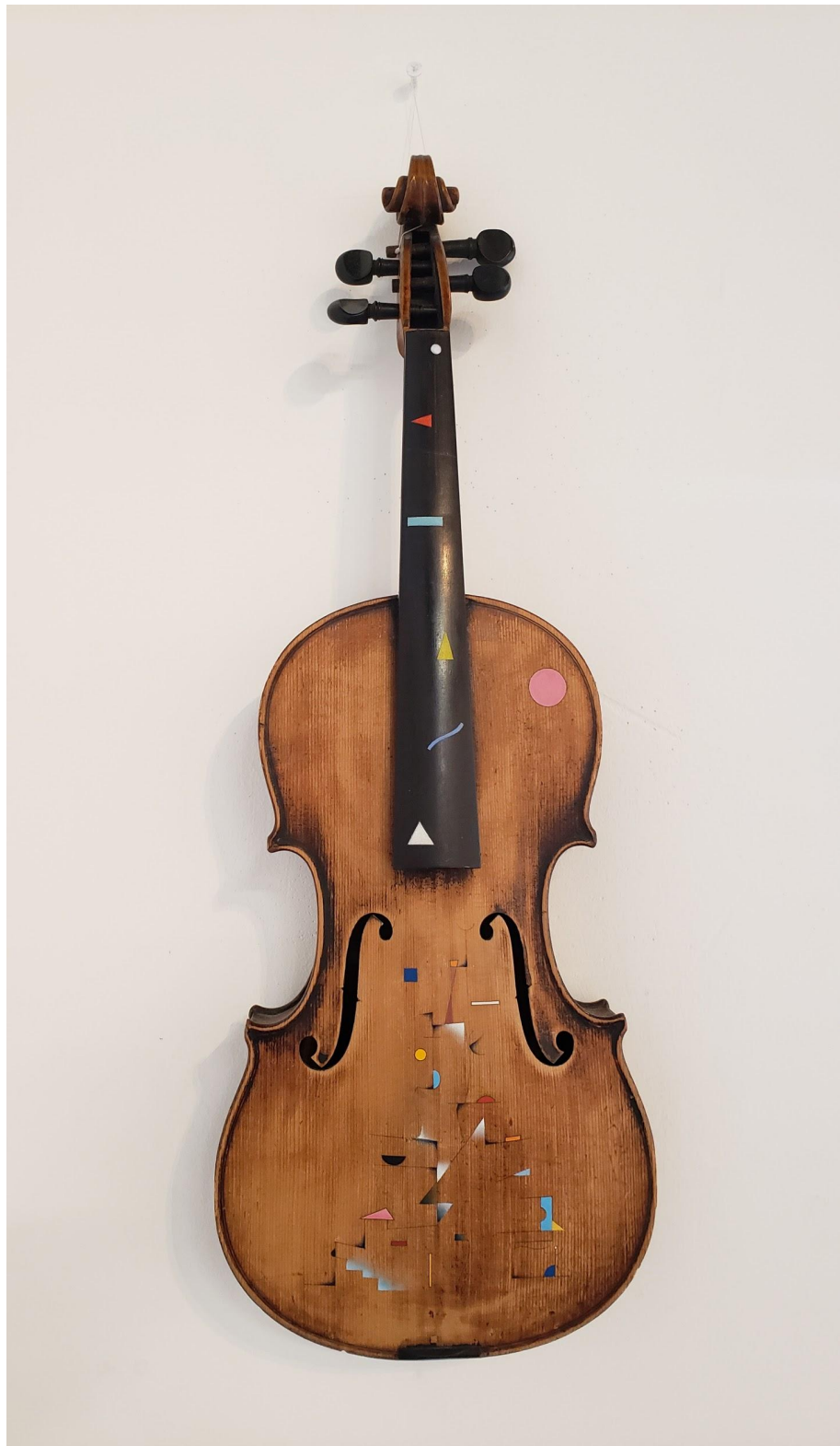
Jeffrey Melzack Adagio 2019 Oil on violin surface $2,500