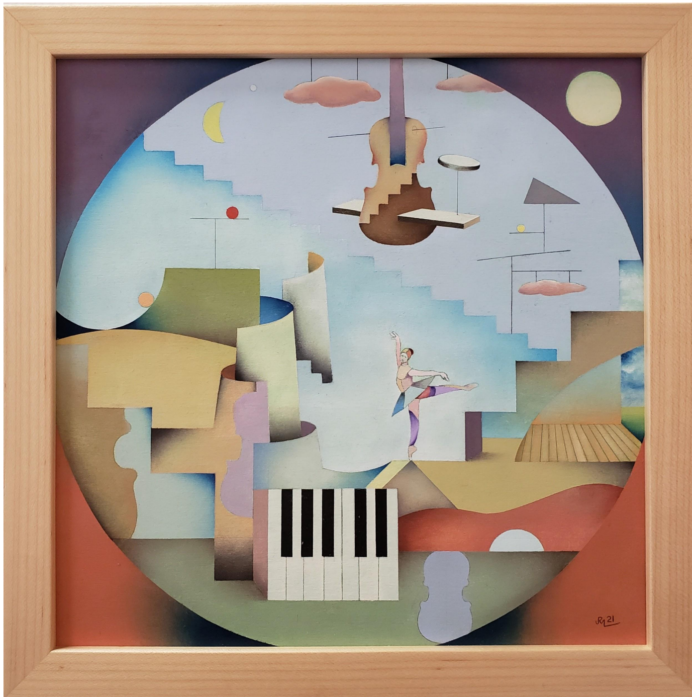
Jeffrey Melzack Little Bird (Ballet) 2021 Oil on wood panel 12 x 12 inches $1,500