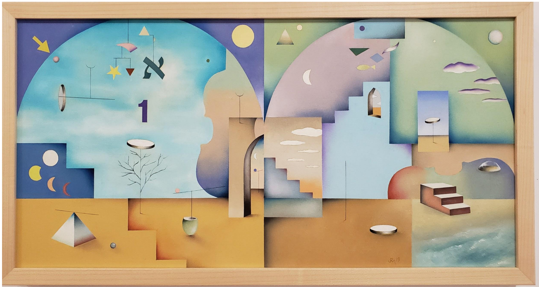
Jeffrey Melzack Koyaanisqatsi, Life Out of Balance 2019 Oil on canvas 20 x 30 inches $2,500