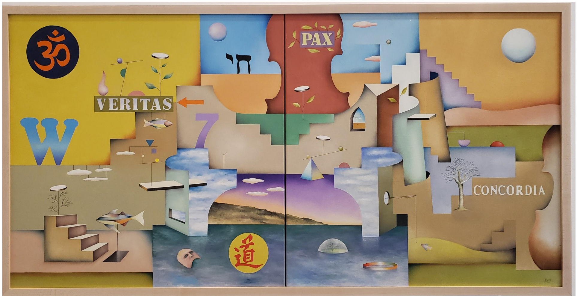
Jeffrey Melzack Seeking 2021 Oil on canvas 48 x 24 inches $ 4,000