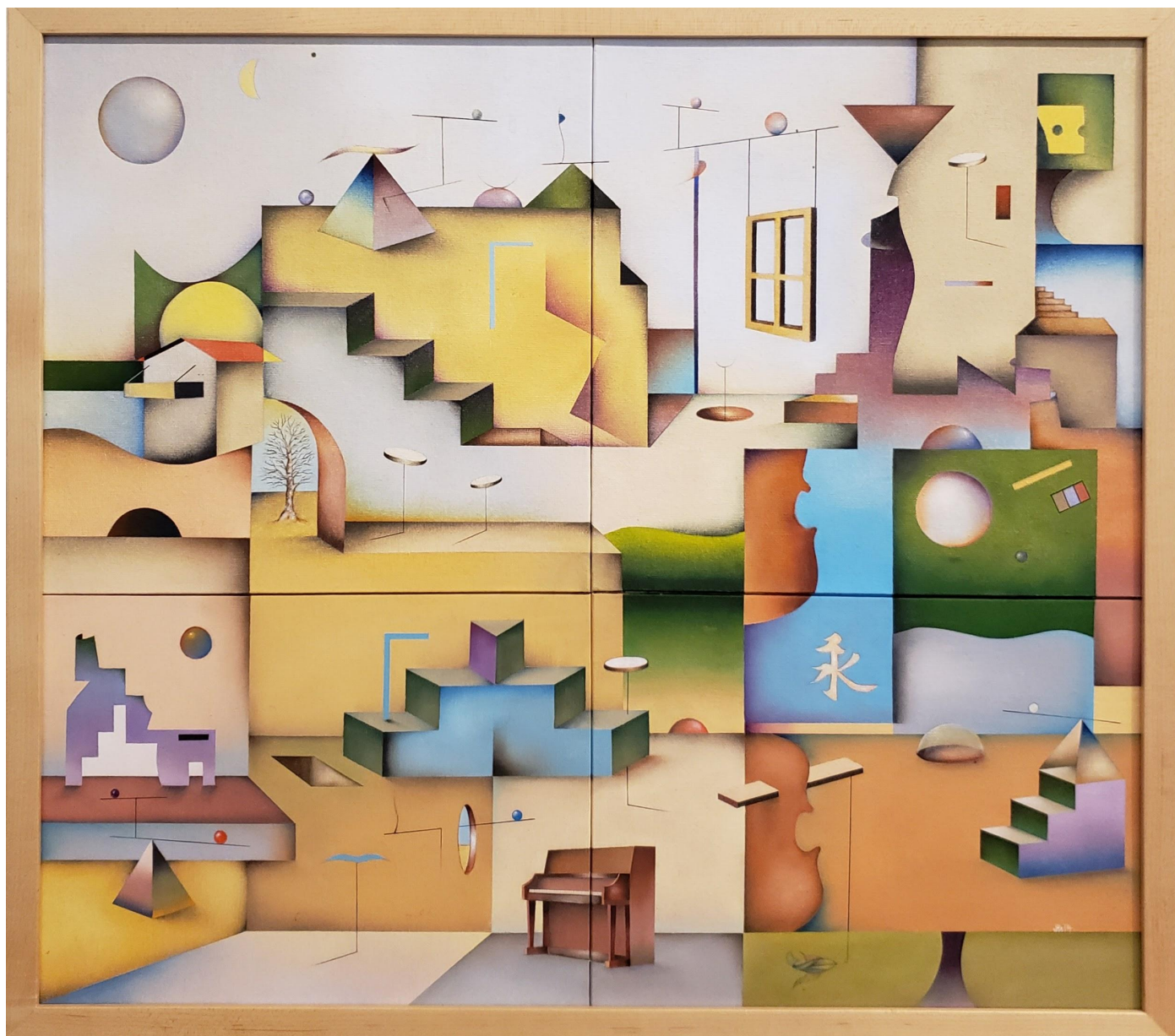
Jeffrey Melzack Inscape Architecture 2019 Oil on canvas 22 x 25 inches $3,000